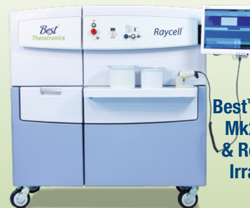
Best™ Raycell Mk2 Blood & Research Irradiator