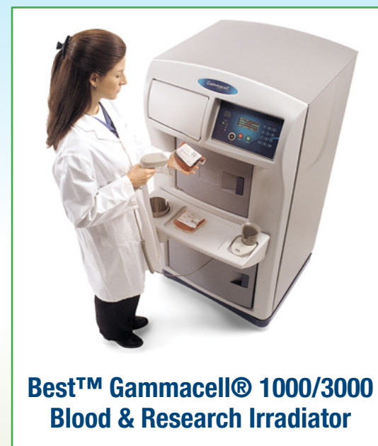
Best™ Gammacell® 1000/3000 Blood & Research Irradiator

With NEW Multi-Leaf Collimator for 80 and 100 cm SAD units—IMRT, IGRT, SRS, SBRT and Tomotherapy capable with ActiveRx