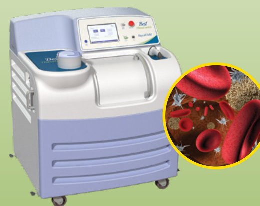
Best™ Raycell Mk1 Blood & Research Irradiator

Best Theratronics Ltd., 413 March Road, Ottawa, Ontario K2K 0E4 Canada tel: 613 591 2100 866 792 8598 www.theratronics.com www.teambest.com