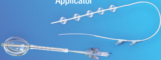
Best™ Breast Double-Balloon Brachytherapy Applicator