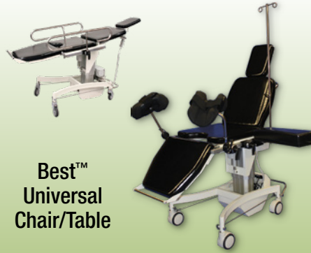
Best™ Universal Chair/Table