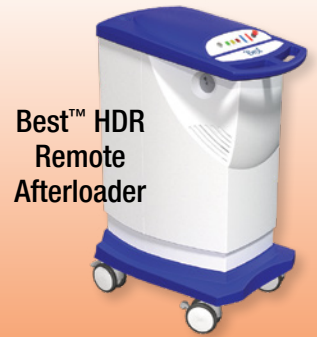
Best™ HDR Remote Afterloader